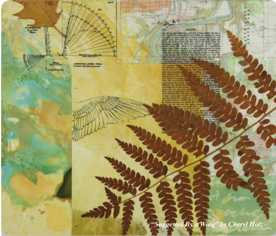
"Suggested By a Wing" by Cheryl Holz