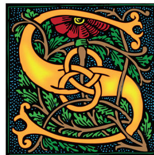
Additional illuminated letter examples