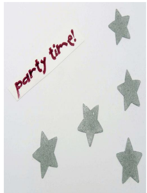
Step 6 A