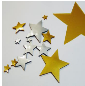
Step 3 Easy