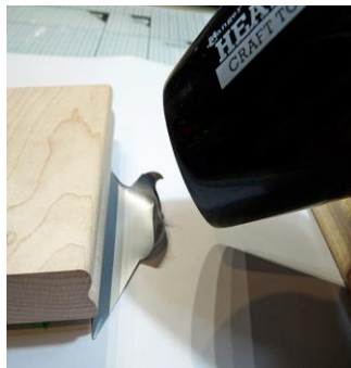
Step 5.3 Advanced