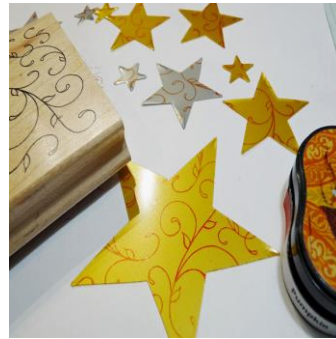
Step 3 Intermediate