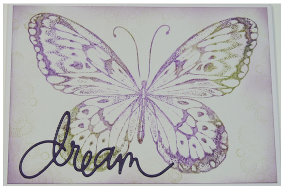
Finished Card Option 2