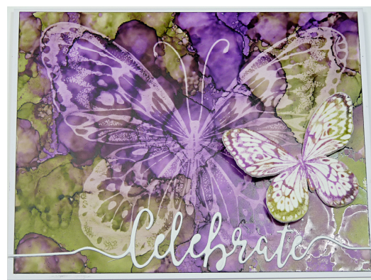
Finished Card Option 1