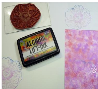
Step 5 & 6