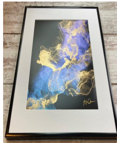
Final Color Shift